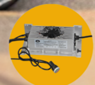
25A Adaptive Charger