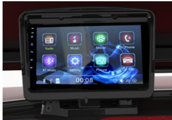
9" TOUCH SCREEN (RADIO, MUSIC, SPEEDOMETER, BLUETOOTH, BACK-UP CAMERA, CAR APP CONNECTION)