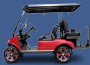
CLASSIC 4 PLUS