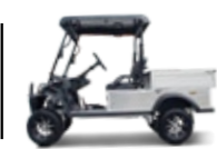
TURFMAN 700 EEC