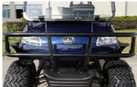
HEAVY DUTY BRUSH GUARD