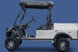
TURFMAN 700 EEC