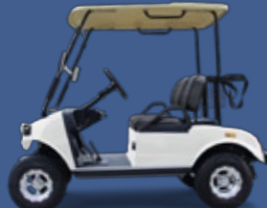
CLASSIC 2 EEC