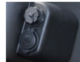
TWO USB CONNECTIONS