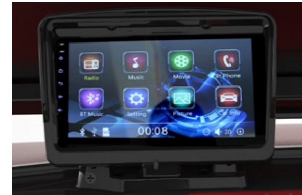
9" TOUCH SCREEN (RADIO, MUSIC, SPEEDOMETER, BLUETOOTH, BACK-UP CAMERA, CAR APP CONNECTION)