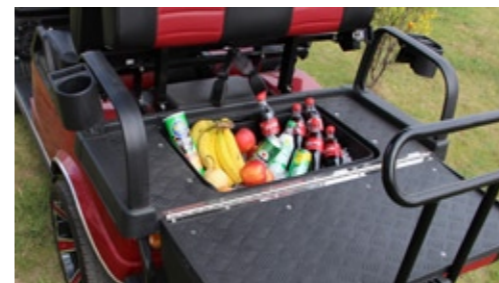
REAR-FACING, FLIP-FLOP SEAT KITS WITH STORAGE COMPARTMENT