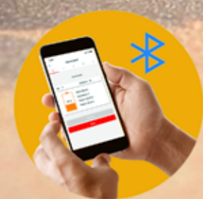
Mobile & PC Live Monitor