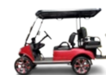
CLASSIC 4 PLUS