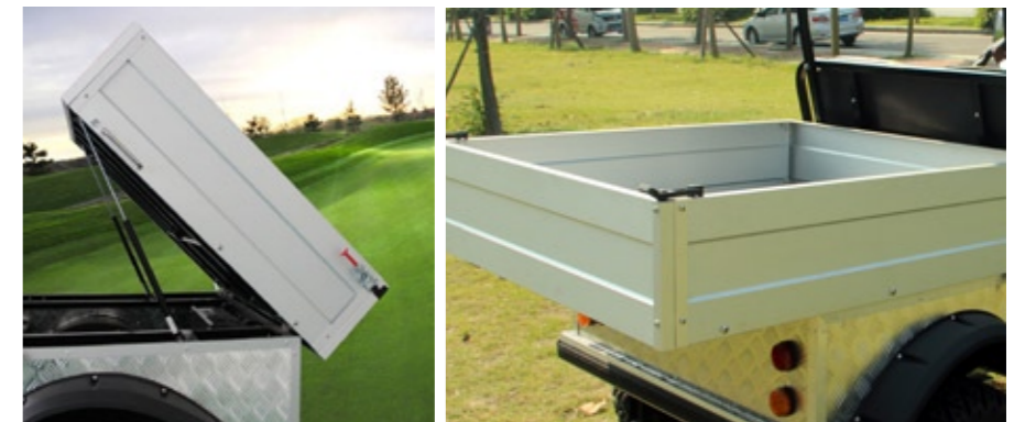
REVERSIBLE ALUMINUM CARGO BOX (SIZE VARIES BETWEEN MODELS )