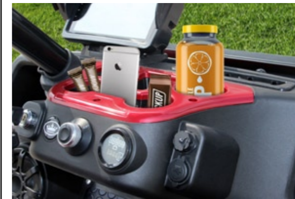
COLOR MATCHED DASHBOARD WITH FOUR CUP HOLDERS/CELL PHONE HOLDER