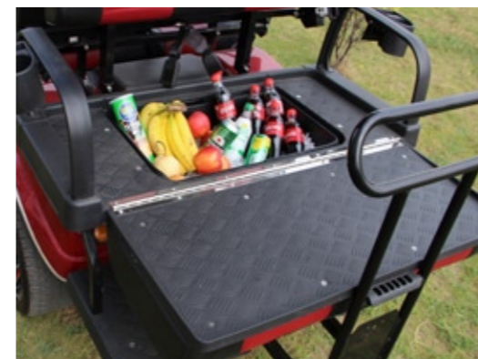
REAR-FACING, FLIP-FLOP SEAT KITS WITH STORAGE COMPARTMENT