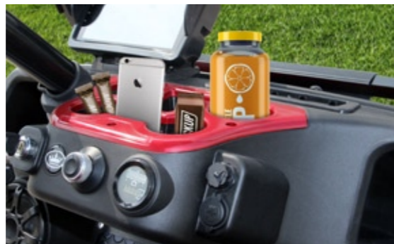
COLOR MATCHED DASHBOARD WITH FOUR CUP HOLDERS/CELL PHONE HOLDER