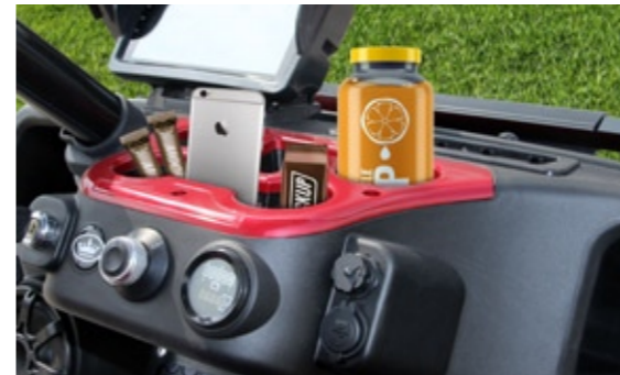
COLOR MATCHED DASHBOARD WITH FOUR CUP HOLDERS/CELL PHONE HOLDER