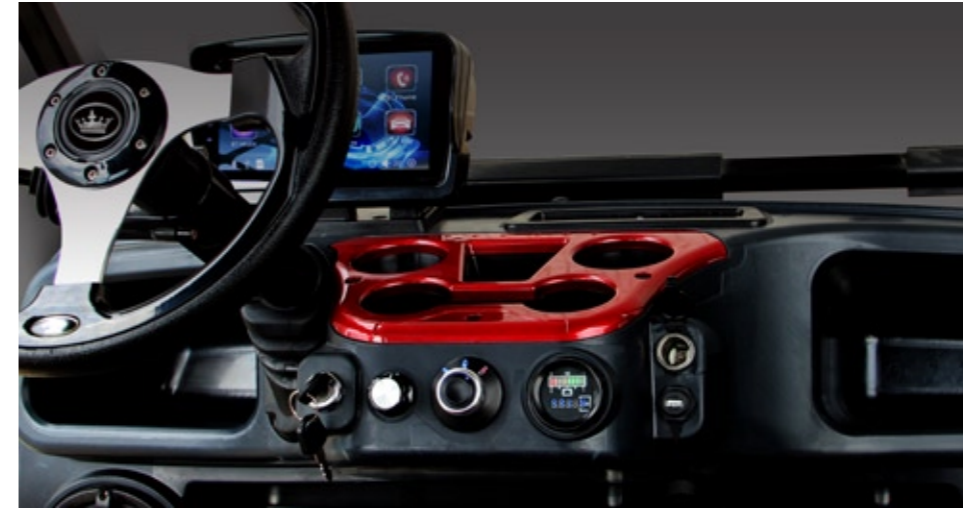
AUTOMOTIVE DESIGNED DASHBOARD, COLOR MATCHED CUP HOLDER INSERT