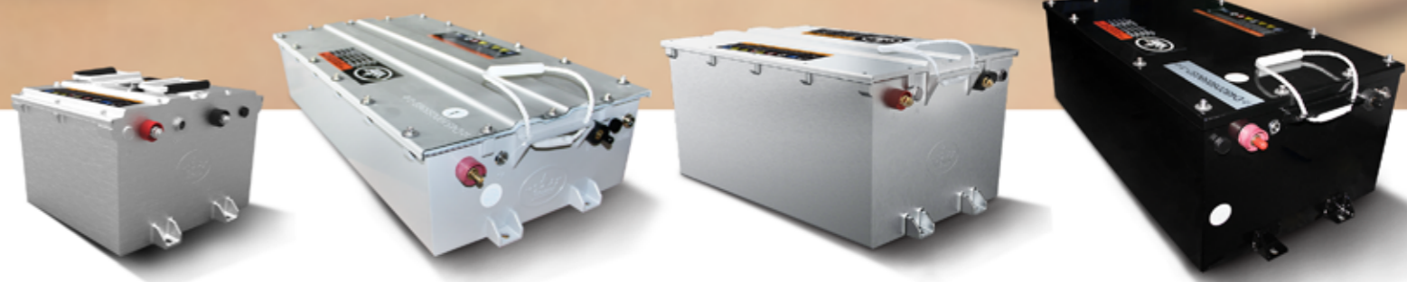
MODEL:60Ah MODEL:100Ah MODEL:110Ah MODEL:205Ah

L series products are lithium-ion battery packs with integrated golf cart battery system. They are designed to replace the lead-acid batteries, which are available for drop-in replacement in golf carts easily. The benefits of lithium-ion battery include lighter weight, shorter charging time, longer life, free maintenance and to save much electricity bill for you. Our battery has an integrated management system which includes an On/Off switch and a state-of-charge(SOC) gauge.