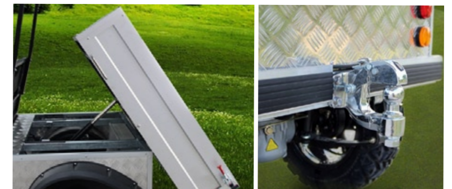
ELECTRIC TIPPER & TOWING HOOK (OPTIONAL)