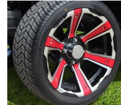
14" ALLOY WHEEL RIMS WITH COLOR MATCHING INSERTS AND RADIAL DOT TIRES