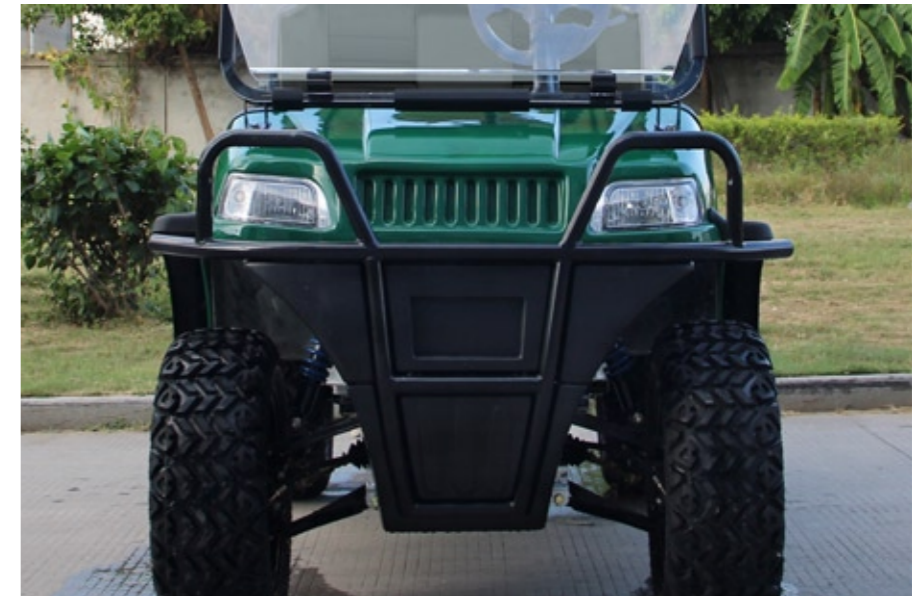
HEAVY DUTY BRUSH GUARD