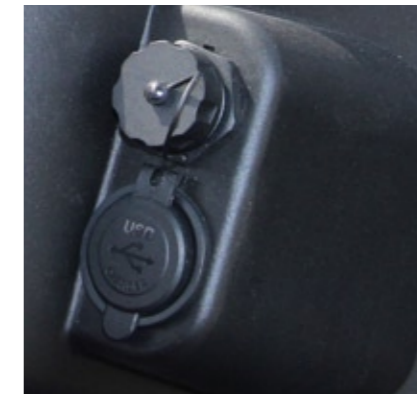
TWO USB CONNECTIONS