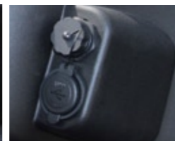
TWO USB CONNECTIONS