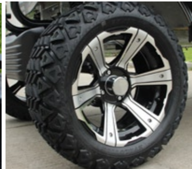
14" ALLOY WHEEL RIMS WITH COLOR MATCHING INSERTS AND OFF ROAD TIRES