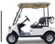
CLASSIC 2 EEC