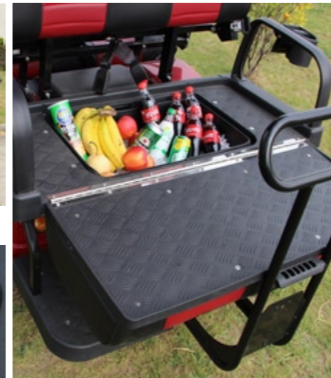
REAR-FACING, FLIP-FLOP SEAT KITS WITH STORAGE COMPARTMENT