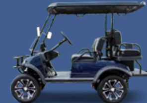
FORESTER 4 PLUS