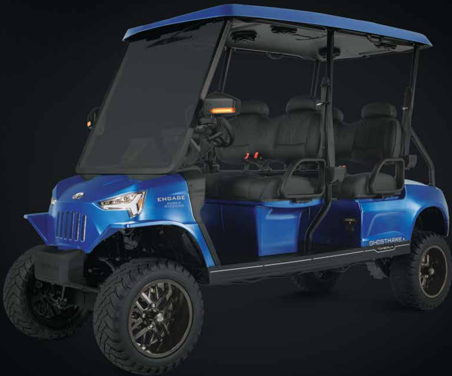
Engage E4 Ghosthawk shown with Matte Lux Blue body and black CoolTouch™ seats.