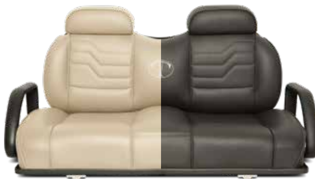
CoolTouch™ Sandstone or Black