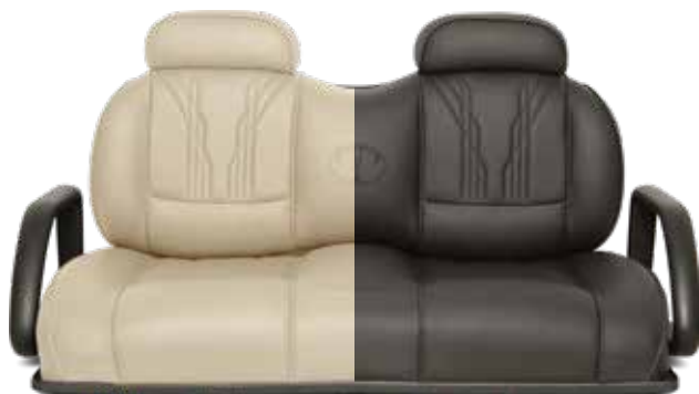
CoolTouch™ Sandstone or Black