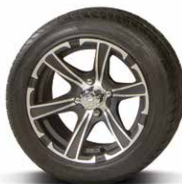
14-inch "T" aluminum wheels with 22-inch steel belted radial tires