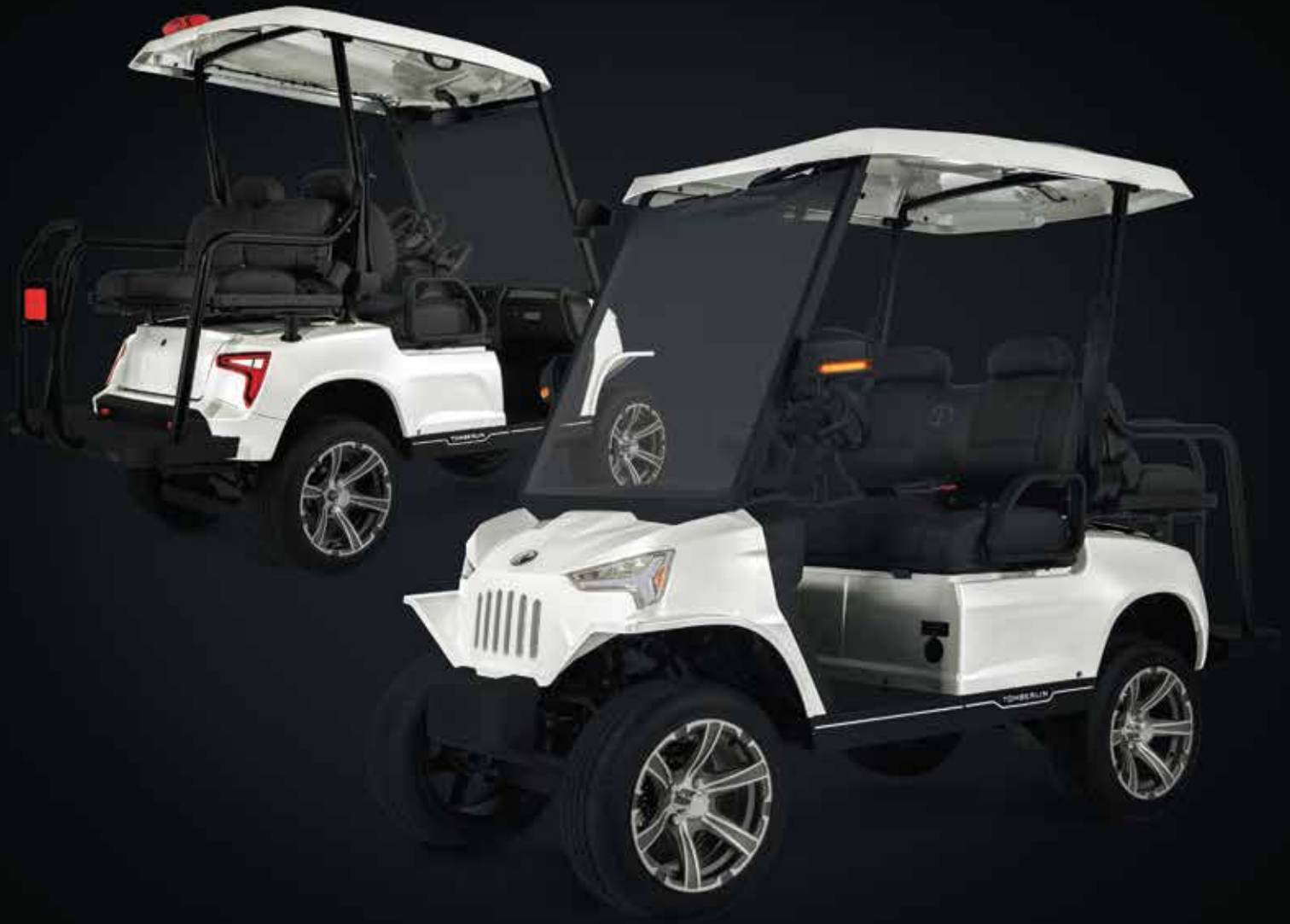
Engage E2+2 LXR shown with White Diamond body and black CoolTouch™ seats. Shown without standard headliner.

©2023 Columbia Vehicle Group. All Rights Reserved. Tomberlin — a brand of the Columbia Vehicle Group, Inc. which is a subsidiary of the Nordic Group of Companies, Ltd., headquartered in Baraboo, WI — is a manufacturer of electric vehicles designed for open neighborhoods, golf courses, master planned communities, and short distance commuting. Since 1984, the Columbia Vehicle Group brands have represented one of the most expansive electric vehicle product line-ups in the world, serving customers in the consumer, commercial, and industrial markets.