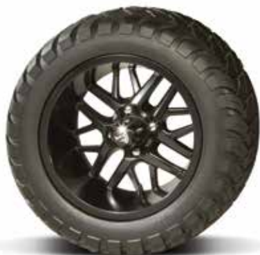
14-inch custom black aluminum wheels with 23-inch all terrain tires or upgrade steel belted radial tires