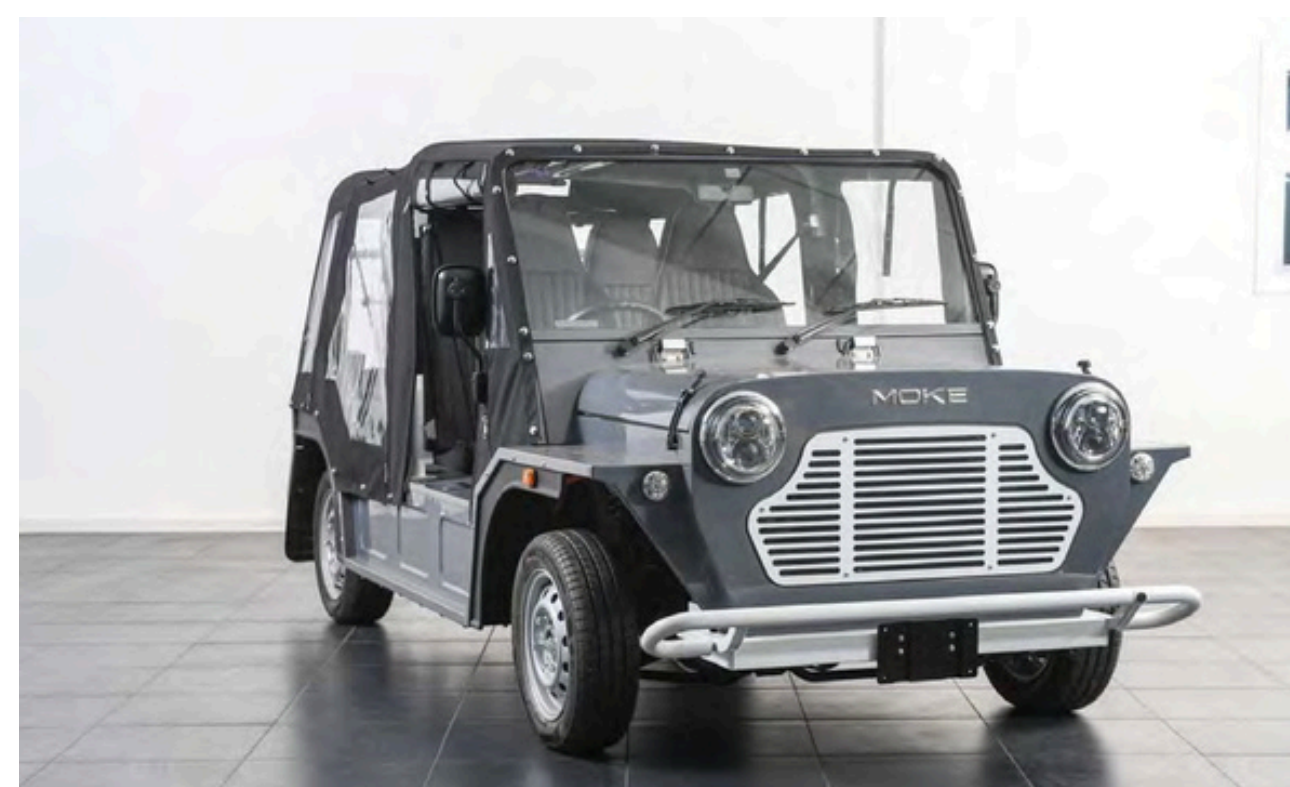
Optional extra shown: Canopy