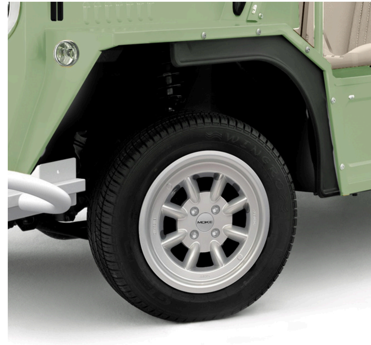
Optional extra shown: Alloy Wheels 165/55 R13*